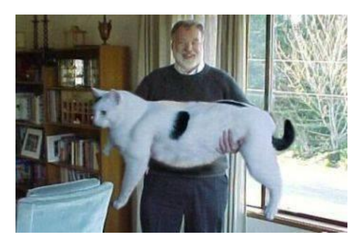
Is this house cat real or fake?