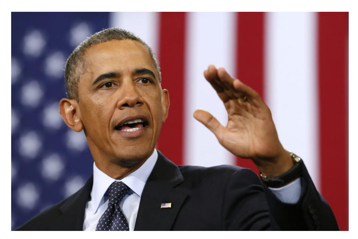
Is this man the constitutional president of the United States of America?