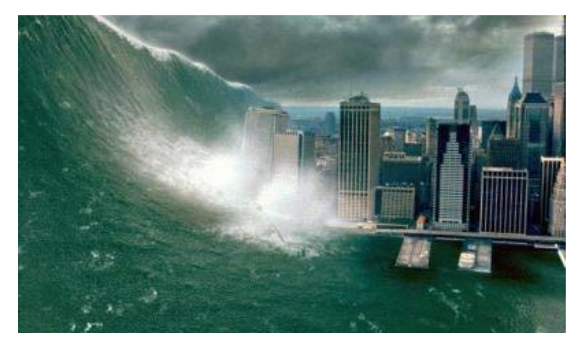
Is this tsunami in New York City real or fake?