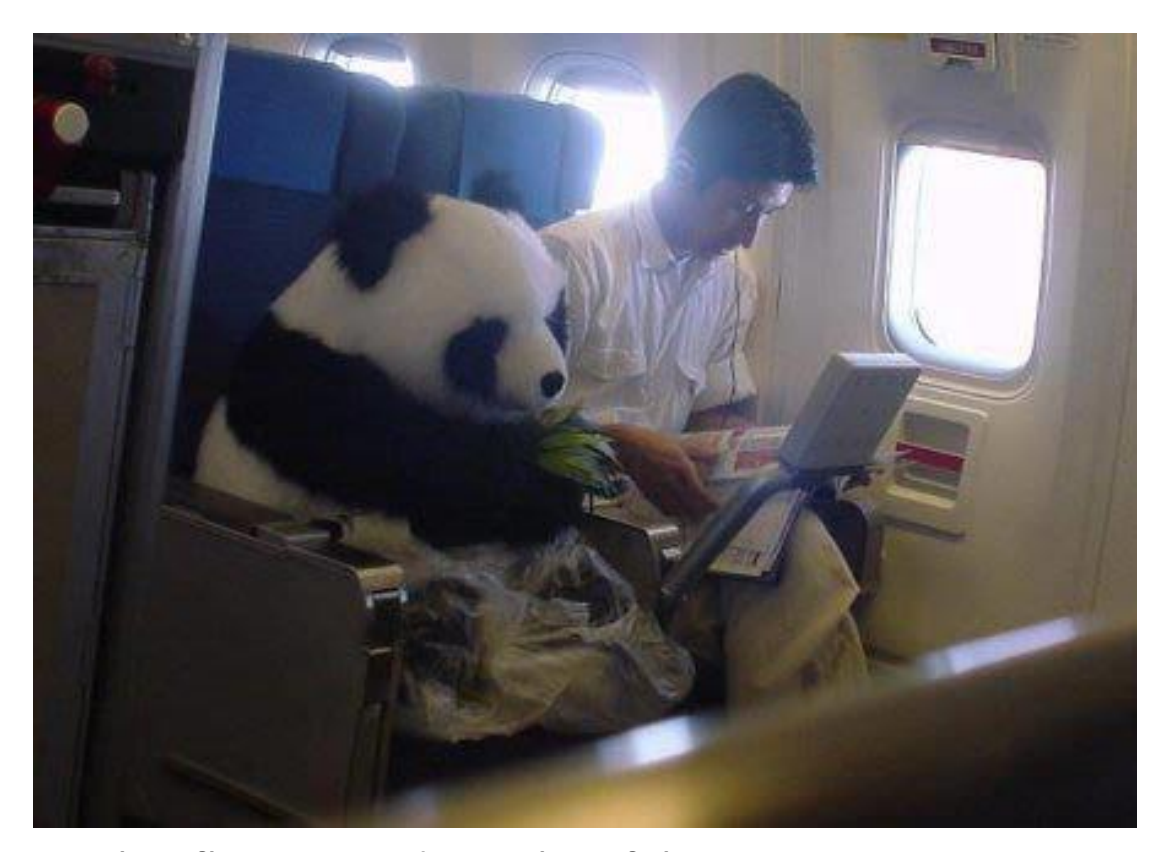
Is this flying panda real or fake?