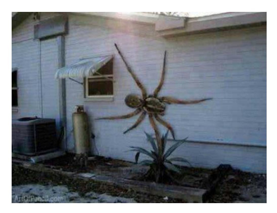
Is this wall spider real or fake?