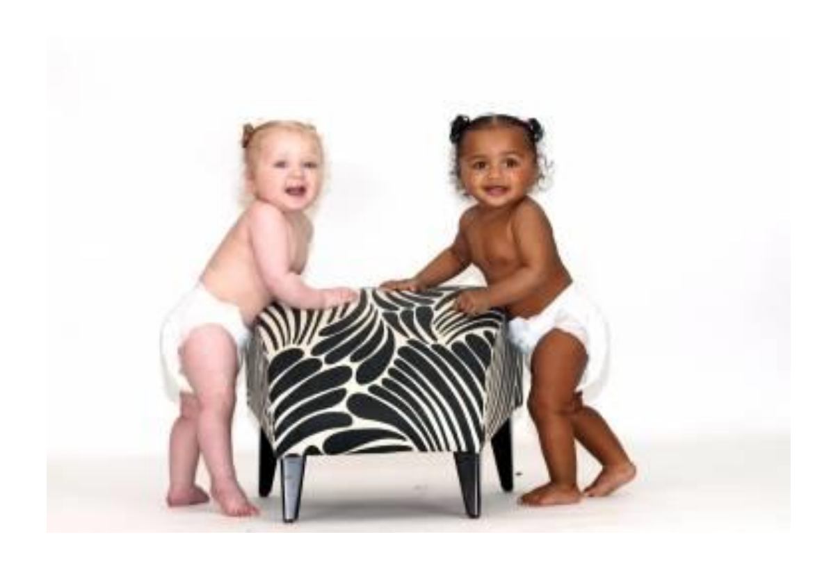
Is this set of twins – one white and one black – real or fake?