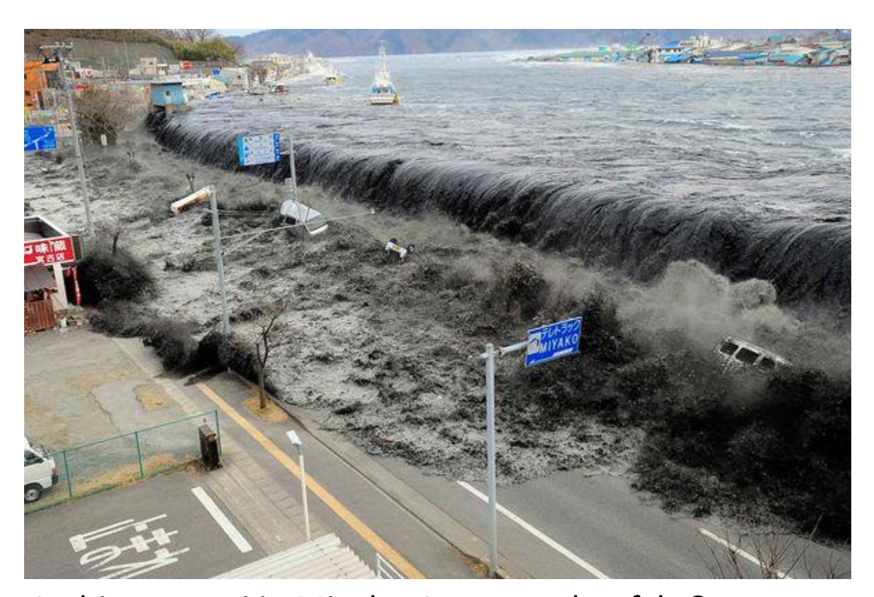
Is this tsunami in Miyako, Japan, real or fake?