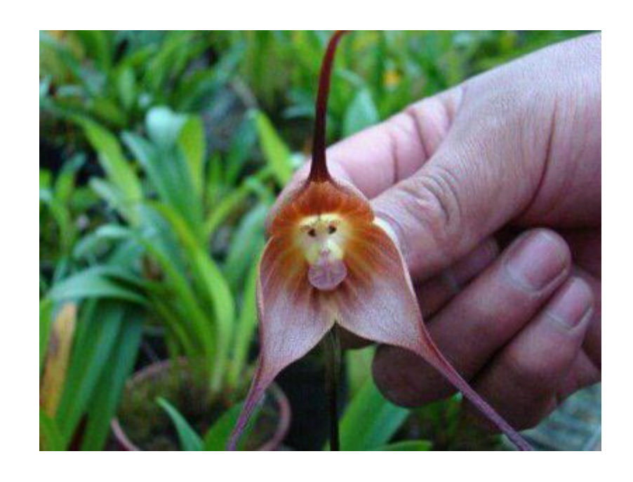
Is this orchid blossom real or fake?