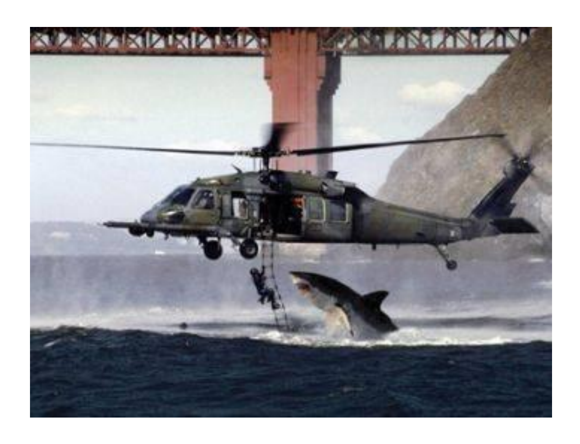
Is this shark attack real or fake?