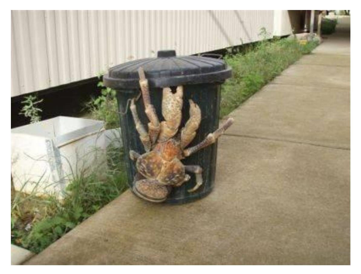
Is this coconut crab real or fake?