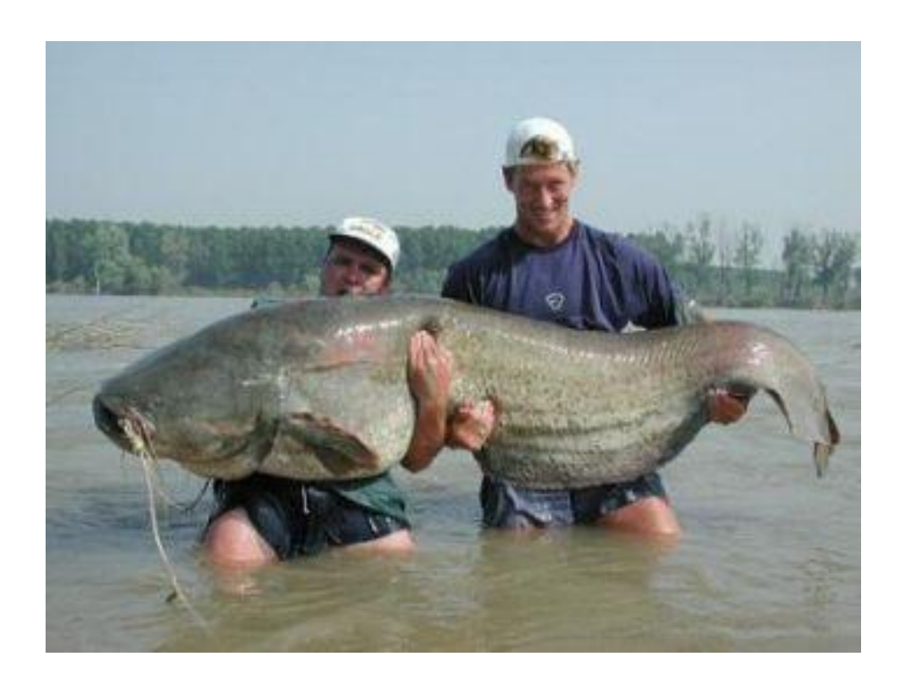
Is this catfish real or fake?