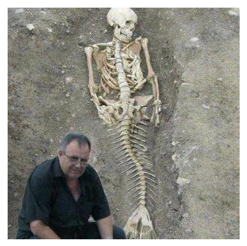
Is this mermaid skeleton found near the Black Sea real or fake?