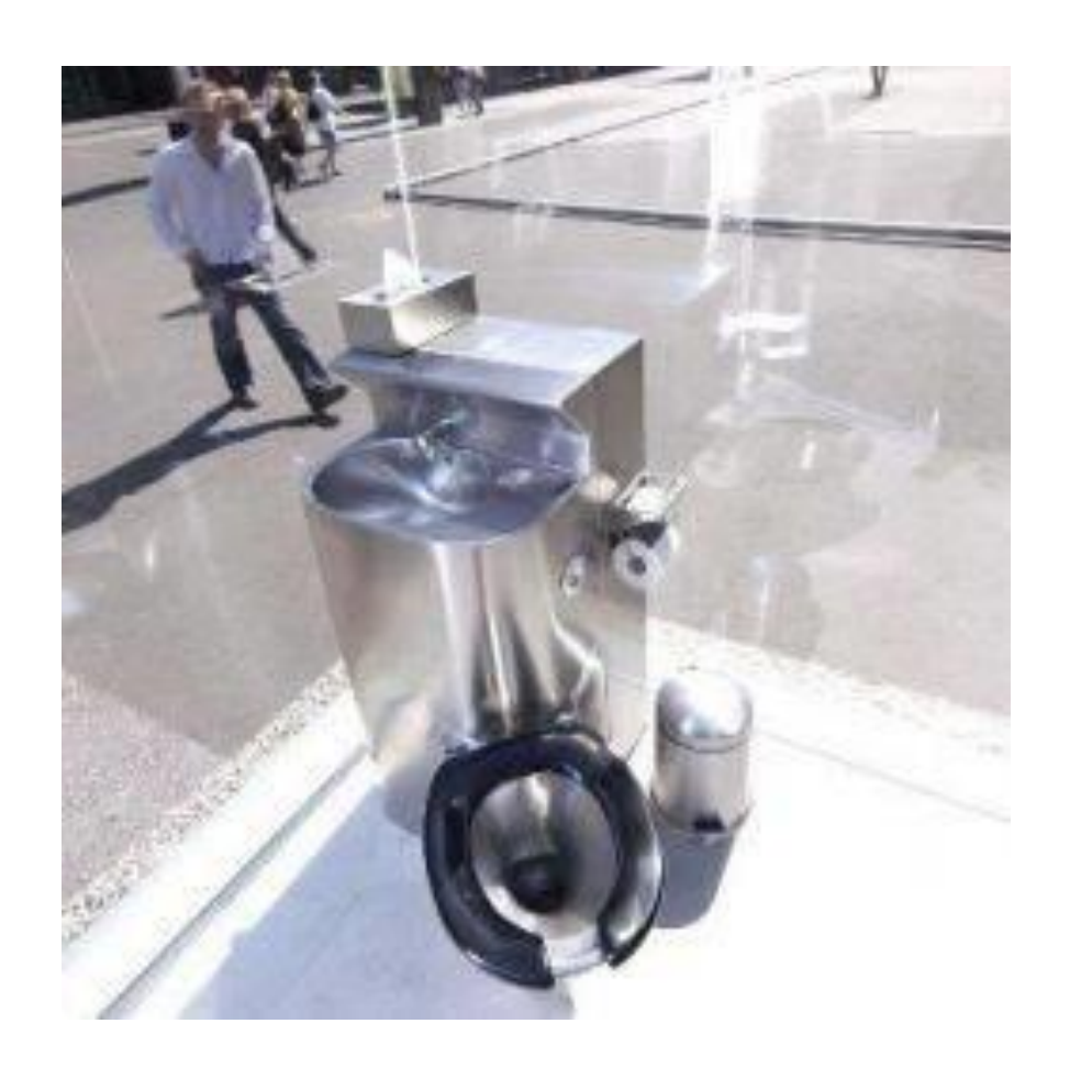
Is this public toilet with one-way glass walls real or fake?