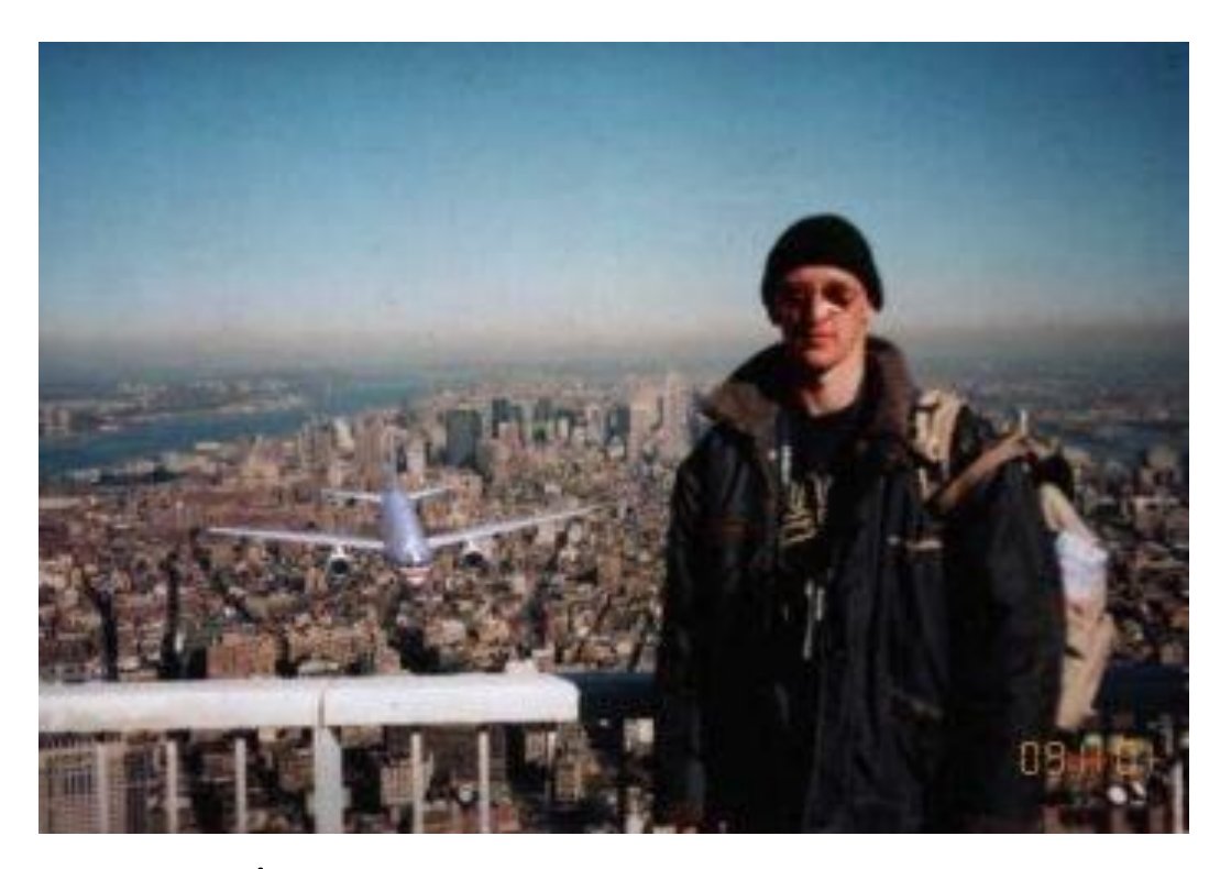
Is this 9/11 tourist snapshot real or fake?