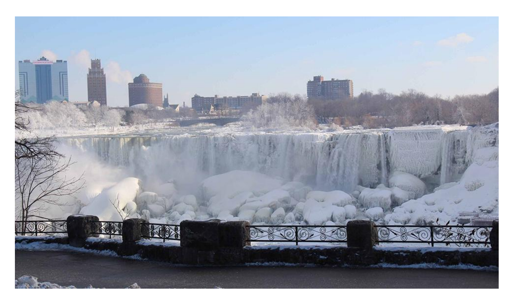
Niagara Falls - Jan. 9, 2014