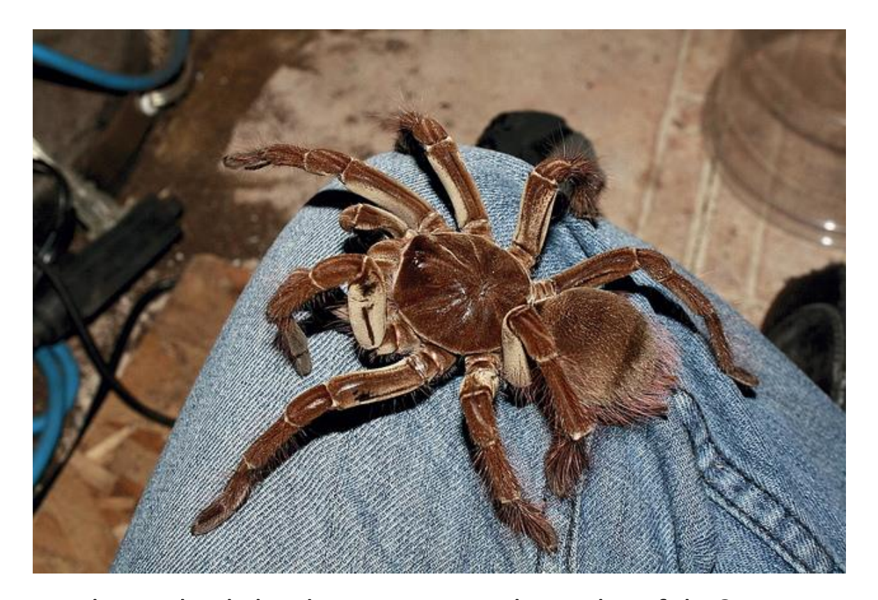
Is this goliath birdeater tarantula real or fake?